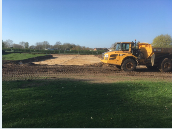
Large earth moving equipment employed