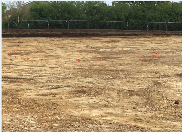
What Lies Beneath?