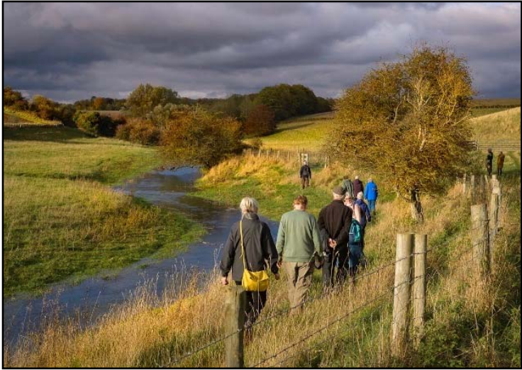
Many thanks to Bartle Frere for the photographs — more are online, available upon request!