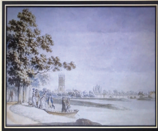
Peter la Cave, 1789