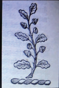
400 years of Oxford's Botanic Garden