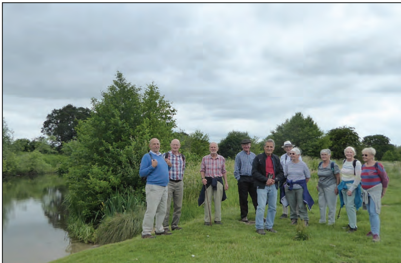
The enthusiastic MarSoc walkers on the path beside the River Thames

We will give notice of future walks that are planned in our regular emails to members.