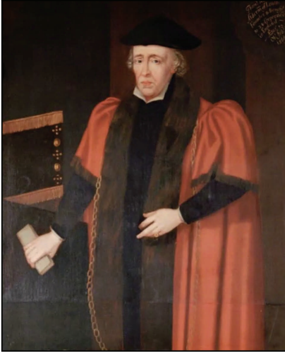
Sir Thomas White (1492-1567)

The college was founded in 1555 by Sir Thomas White, a wealthy London merchant Taylor and entrepreneur. He was a shrewd businessman who bought the building and acquired considerable land for St. John's, not just in Oxford but in cities such as London and Bristol. He also established a number of educational foundations including Merchant Taylors' schools which have had close links with the college.