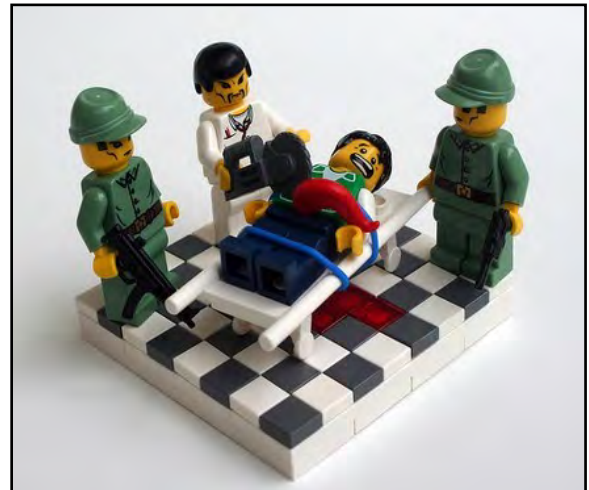
Two less gory illustrations from James’ PowerPoint presentation!