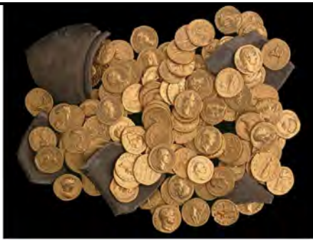
Found in 1995 and now also on display in the Ashmolean