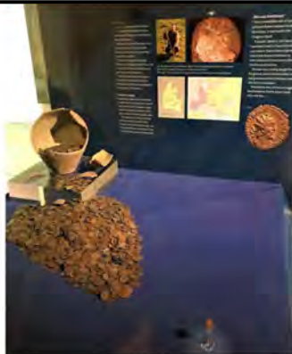
Discovered in 2003 and now it is on display in the Ashmolean Museum.

4,957 bronze coins were found in a pot. Some were 'silvered' but all dating from AD 251-279 - a time of crisis between AD 200 and 300 when central control was lost.