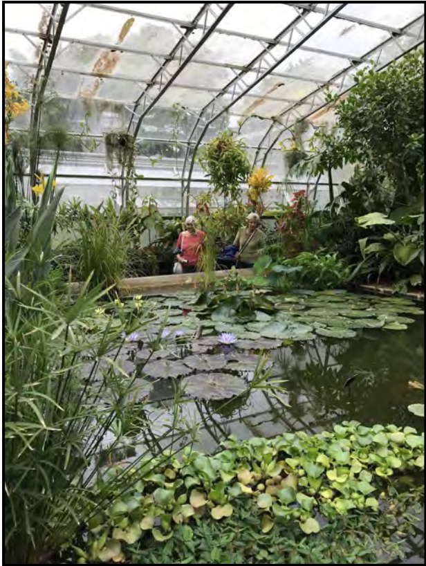
Inside the glass houses there were large lily pads, colourful pitcher plants and carnivorous fly catchers.