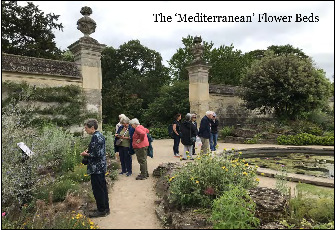
The 'Mediterranean' Flower Beds