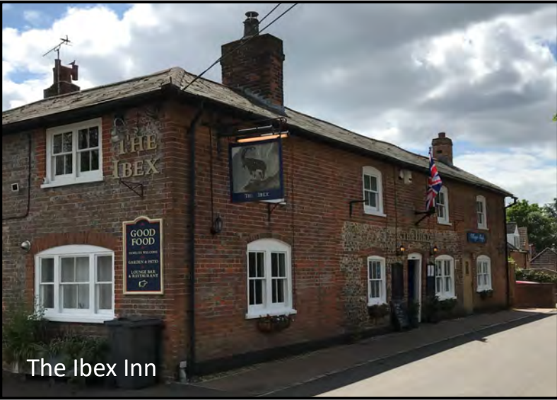
The Ibx Inn