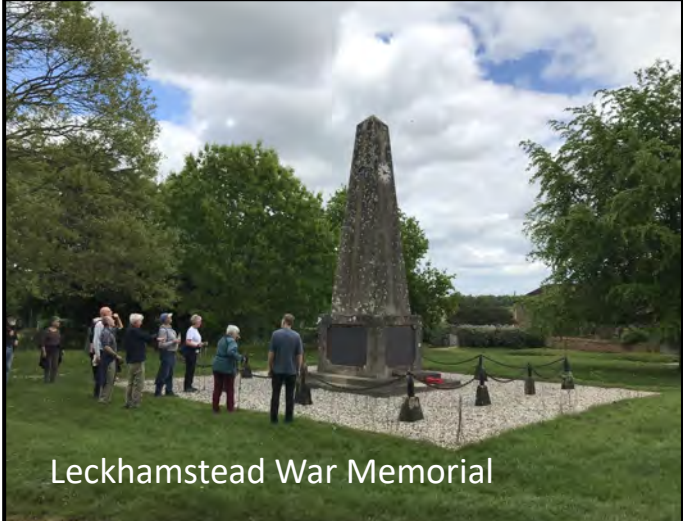
Leckhamstead War Memorial