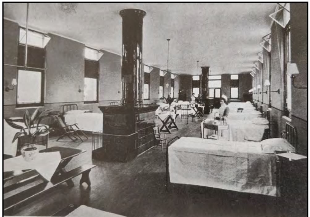
03. Scarlet Fever Ward.

He described other 19th century isolation units that were not quite so comfortable!