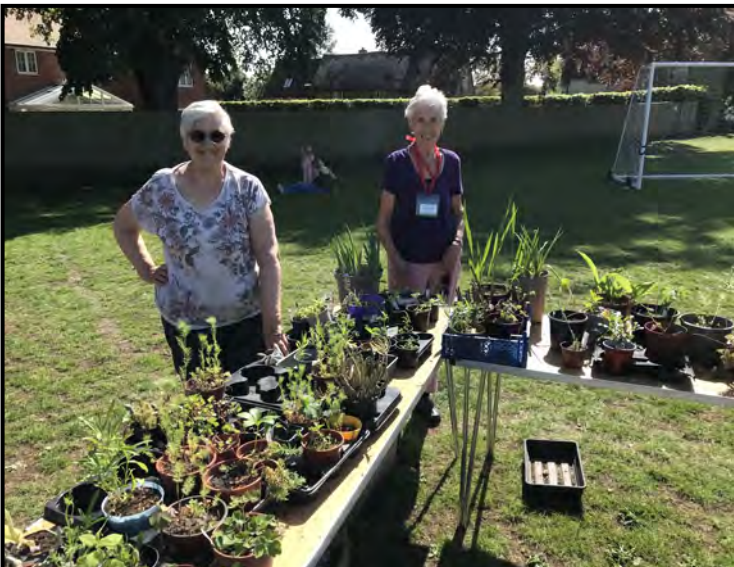
Plants were on sale as well as publications!