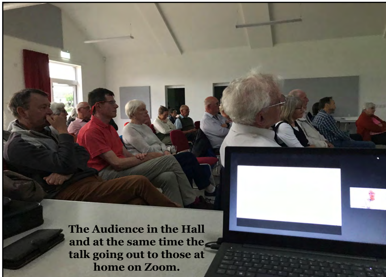
The Audience in the Hall and at the same time the talk going out to those at home on Zoom.