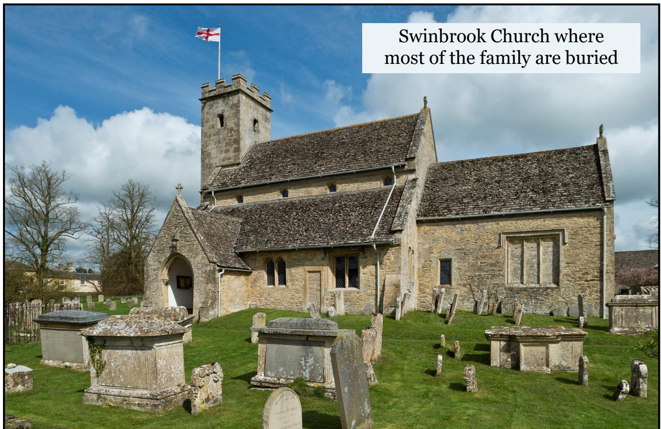
Swinbrook Church where most of the family are buried

Over sixty members and guests enjoyed the evening - most of the audience were in the main hall of the Marcham Centre though some were logged on from home via Zoom.