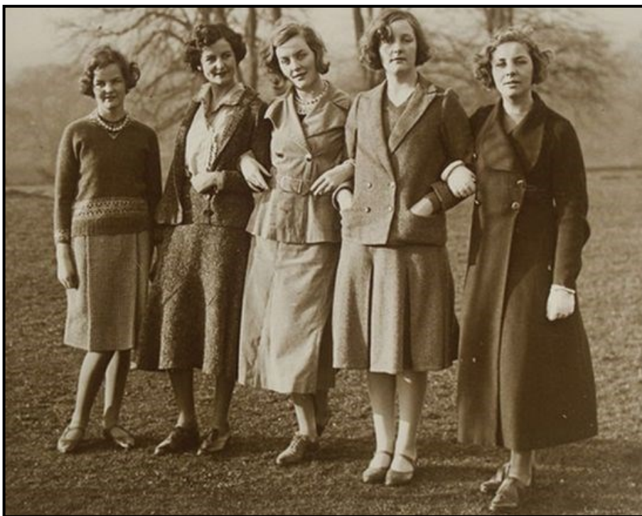
Five Sisters Jessica, Nancy, Diana, Unity and Pamela in 1935 perhaps taken by Deborah

Nancy 1904 Pamela 1907 Thomas 1909 Diana 1910 Unity 1914 Jessica 1917 Deborah 1920