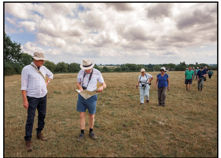
The Leader checking the map...