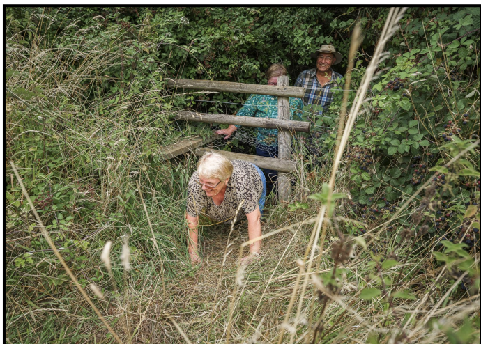
A few difficult moments...