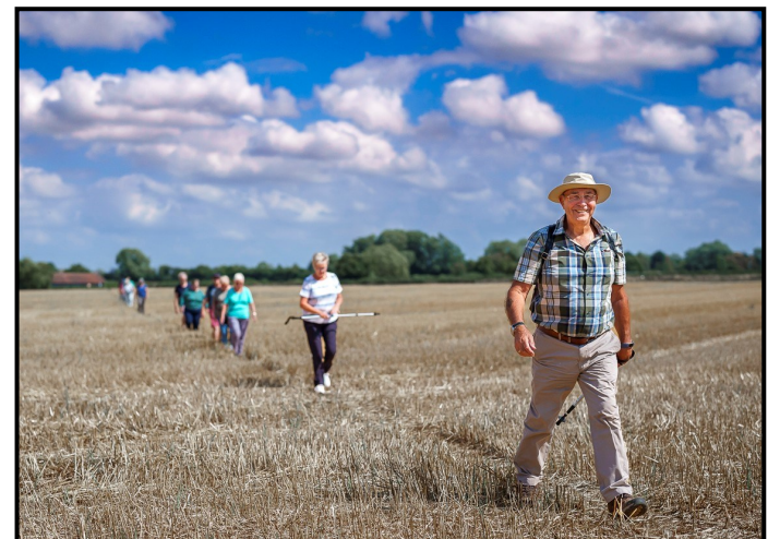
...and then also clear pathways!