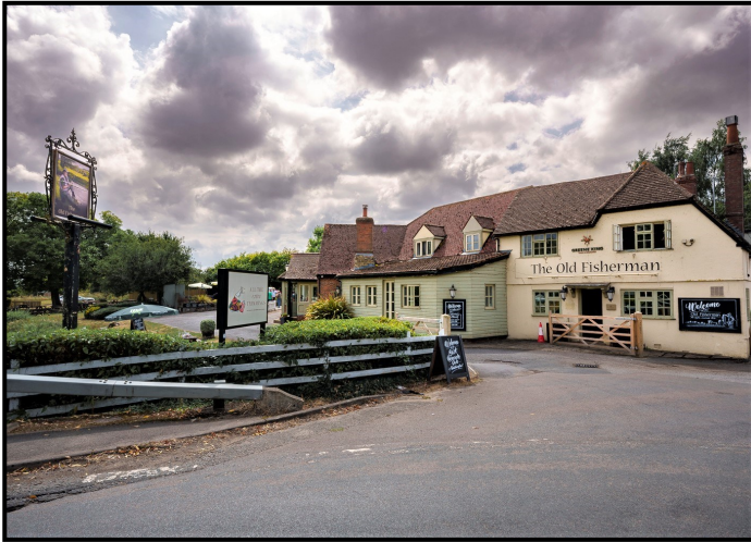
The Old Fisherman for lunch