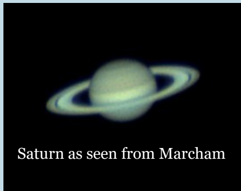
Saturn as seen from Marcham

The sky contains an amazing range of objects – from satellites to galaxies. Some are visible by eye, others need binoculars or a telescope to see them.