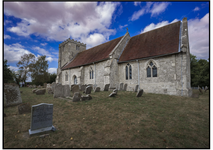
A visit to Shabbington Church