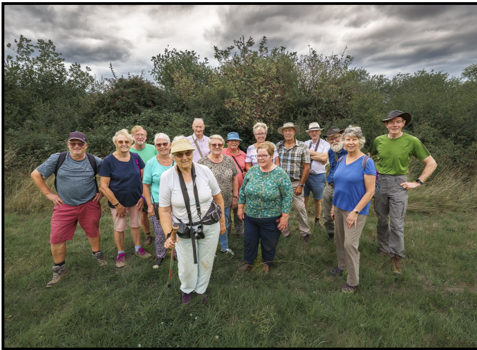
The Group of Intrepid Walkers