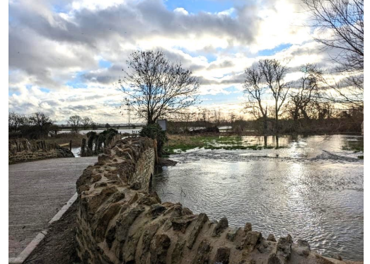
The Mill Bridge surrounded by water