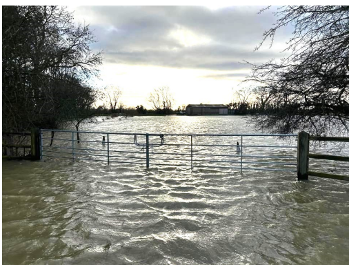
The road and the fields under water