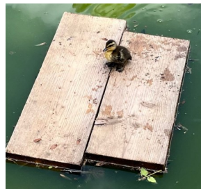
The Wisteria Avenue, the Terracotta Warriors and a duckling stranded in the pond!