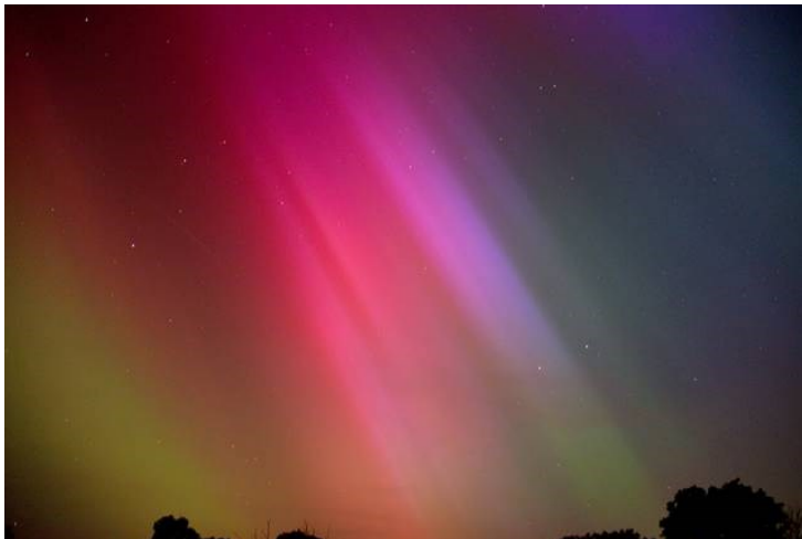
Above : Multi-coloured Aurora seen on 10 th May 2024 at 23:27 from Cow Lane looking west with stars of Leo ( upper left ) and Caster and Pollux ( lower right ) prominent in the background